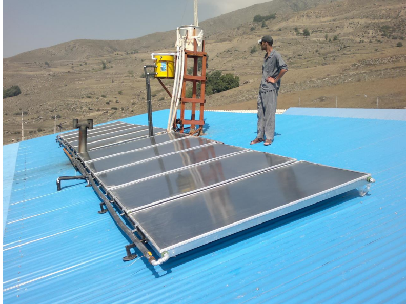
Providing hot water for bathing breeders of Amol Joojeh Company with a capacity of 1000 liters - Mazandaran province