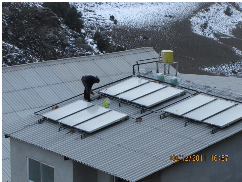
Personnel bathroom of Zaribal Larijan Company, Panjab Farm with a capacity of 2000 liters- Mazandaran