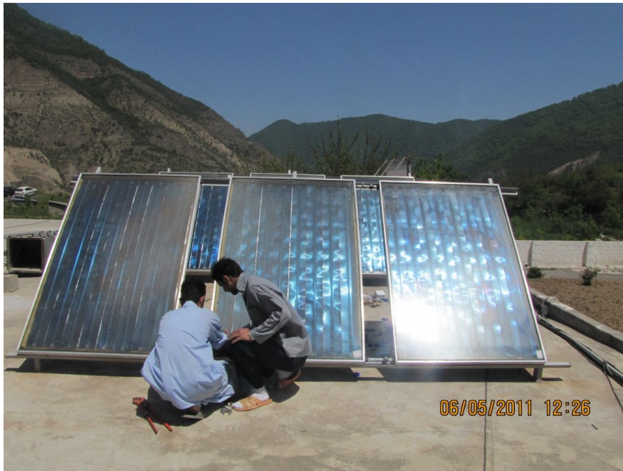
Personnel bathroom of Talavang North Company, Paran Farm, with a capacity of 1600 liters – Mazandaran