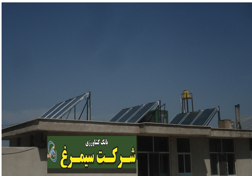
Simorgh Farm - Ziaran - Farm 6 - 1000 liters