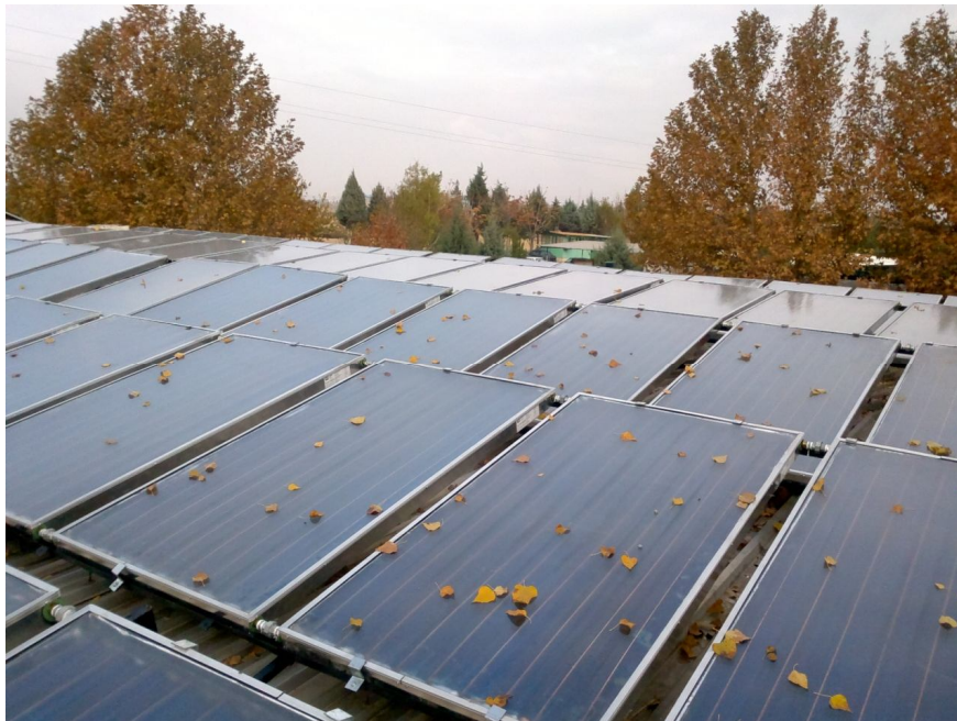
Simorgh Farm - Ziaran - Central bathroom - 9000 liters