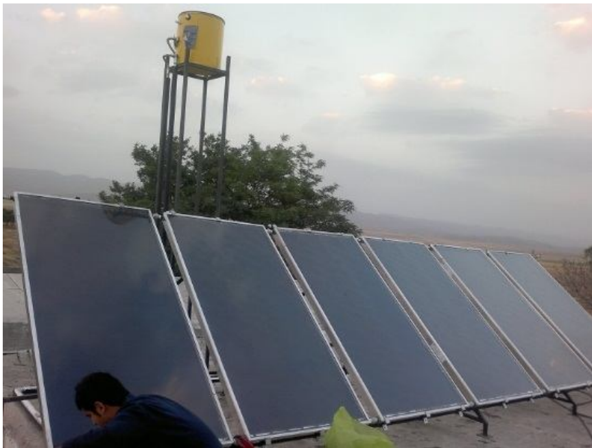
Simorgh Farm - Khorasan unit - 6000 liters