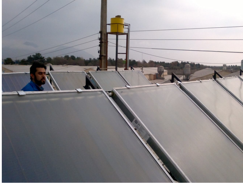
Simorgh Farm - Ziaran - Farm 1 - 1000 liters