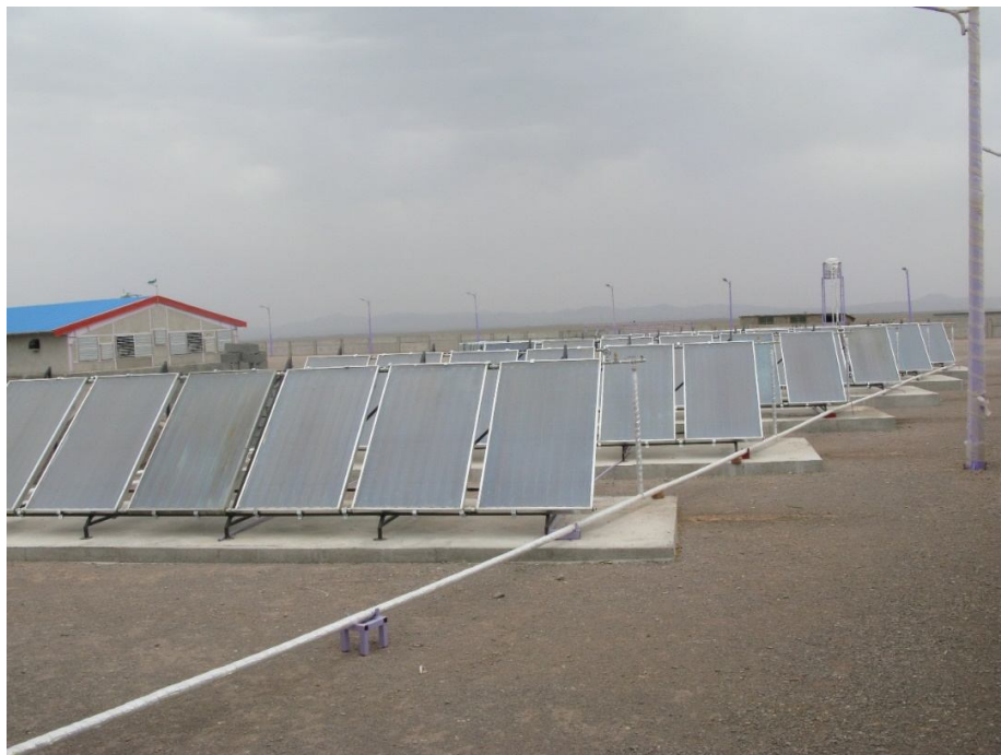
Simorgh Farm - Kerman unit - 3500 liters